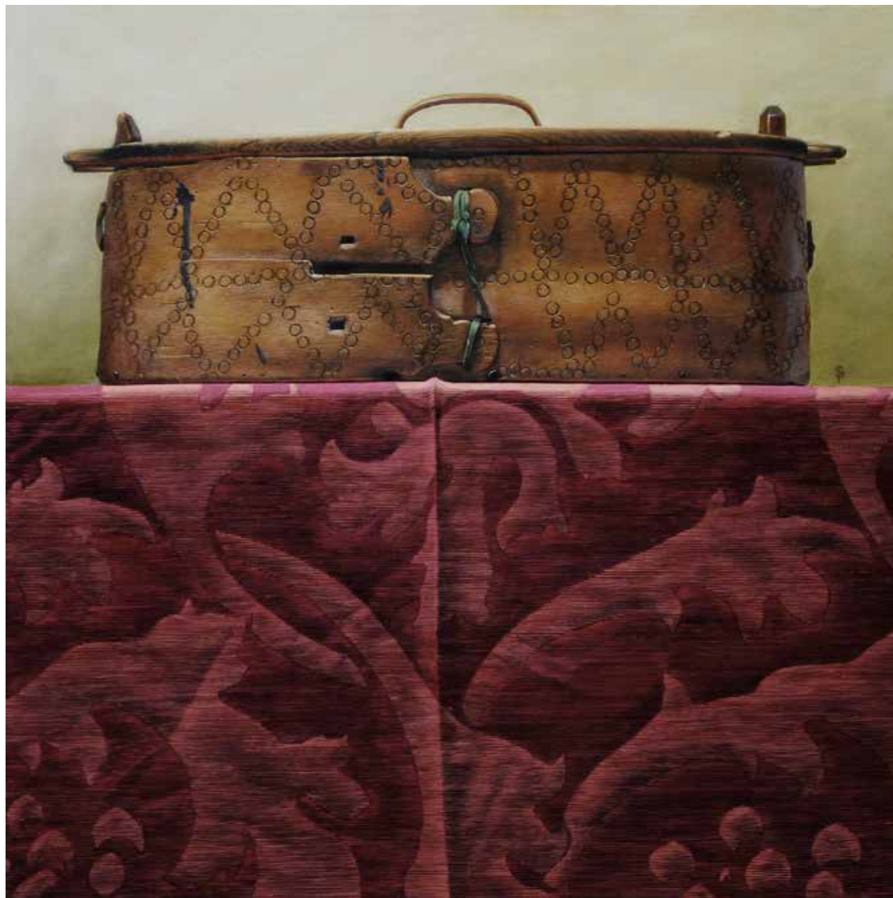
Patricia Glee Smith PANDORA , 2011. Oil on linen. 100 x 100 cm.