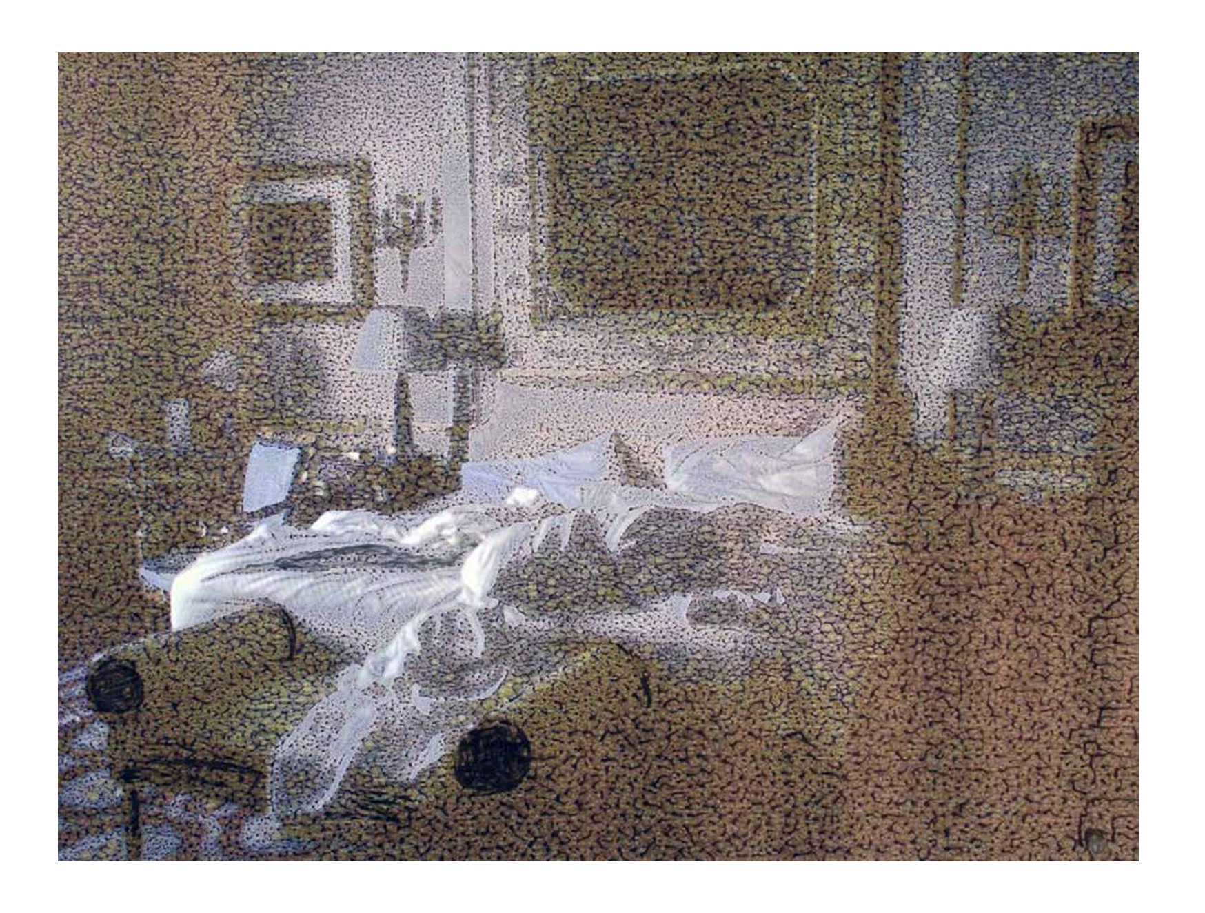
Andrea Annessi Mecci

Hotel Series #2., 2014. Photograph printed with ink on paper. 90 \times 120 centimeters.